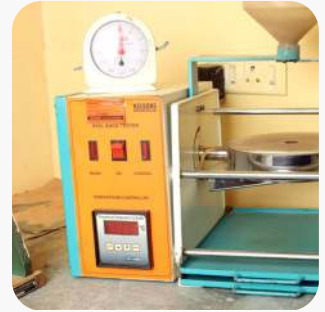
Peel Back Tester