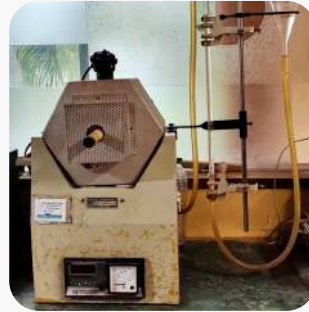
Core Gas Determinator