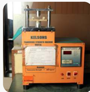
Transvers Strength Machine